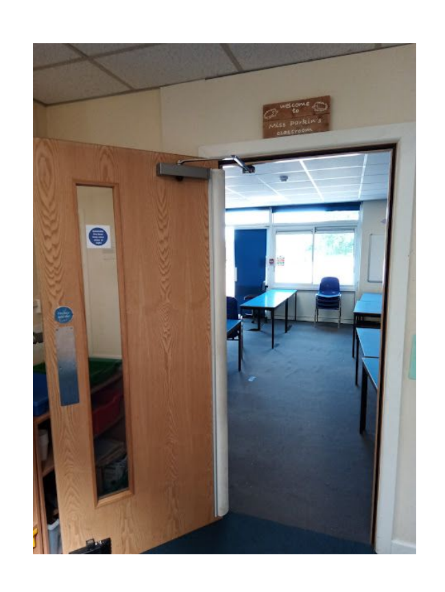
and one from the corridor.