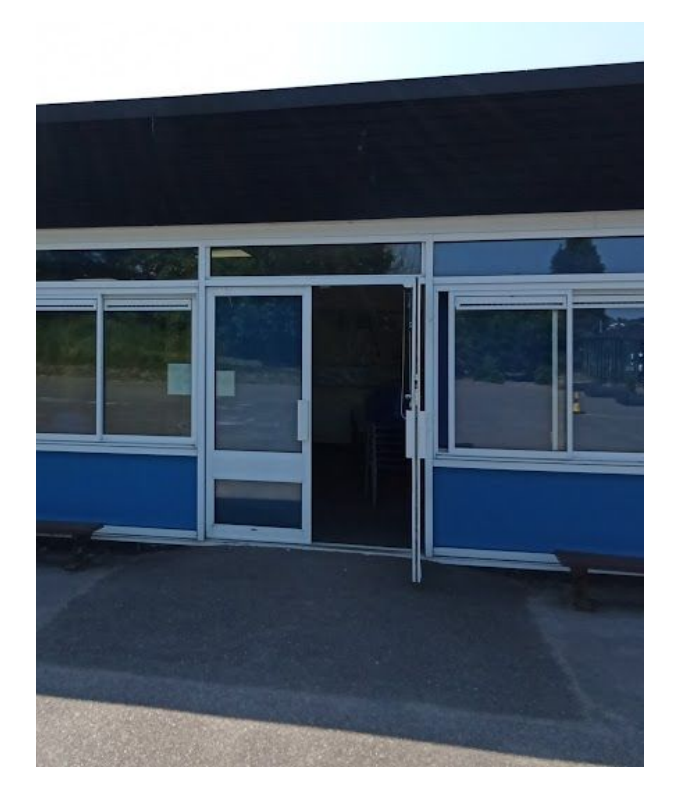
One from the playground