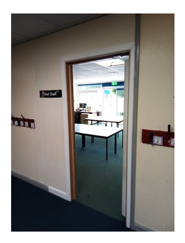
and one from the corridor.